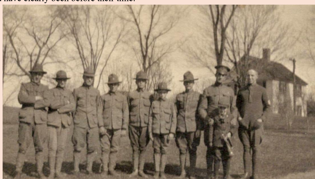
Boy Scouts of 1917

Did the Scouts raise enough money to begin raising a log cabin? Perhaps some of our locals may have heard from their elders if a log cabin was built and could answer that query, though this would have clearly been before their time.