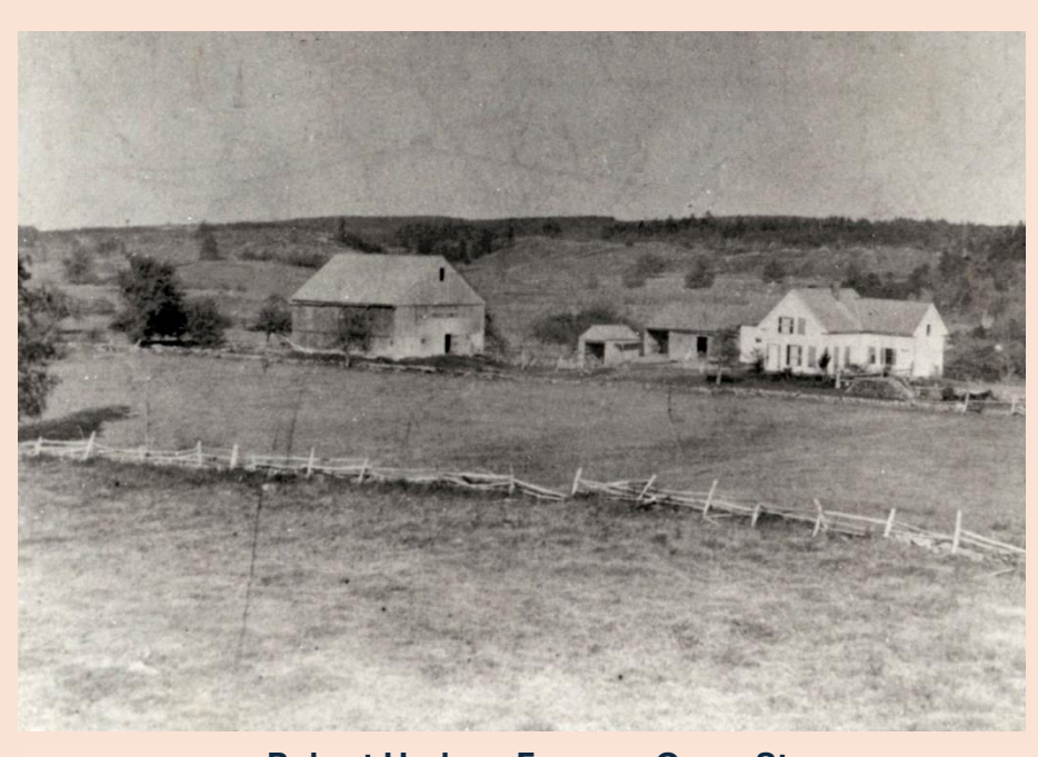
Robert Hudson Farm on Cross St House built c. 1813. In c. 1840, house remodeled and became part of the woodshed and the house now standing dates from that time.

"Farmers have commenced haying in good earnest [1815]."